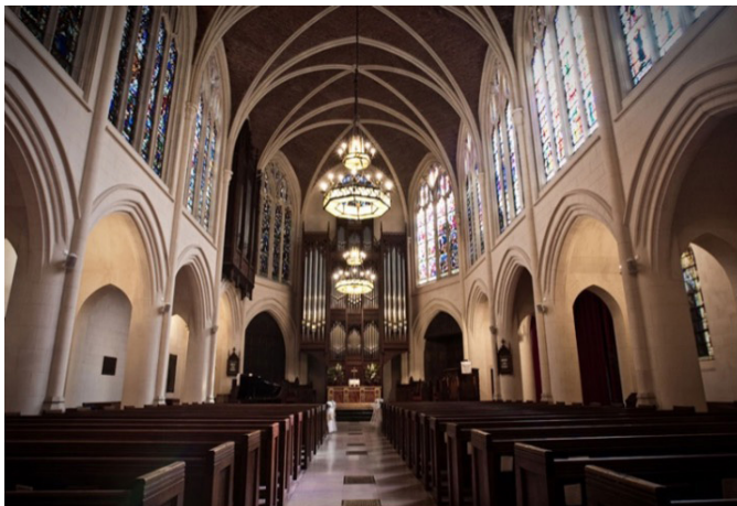
The current sanctuary – it is beautiful, but the 1930’s lighting blocks the Rose and other windows as well as the organ.

Below are just three pictures to give you a sense of the improved aesthetics of the change. These small pictures don’t do justice to the amazing difference this lighting will make to enhance all of the worship services and events at ACP.