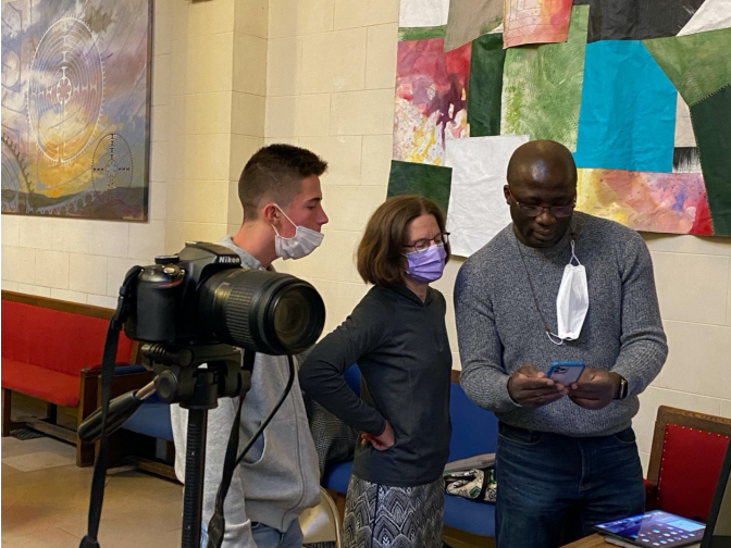
Live stream rehearsal