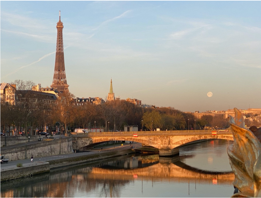
ACP and Eiffel Tower