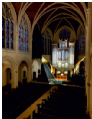
An architectural rendering of the lighting for a concert pianist in the evening!